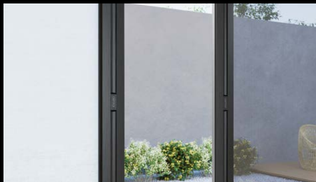
Screen and blind combination configuration

To see the full range of specifications for the S4 System, visit centor.com .