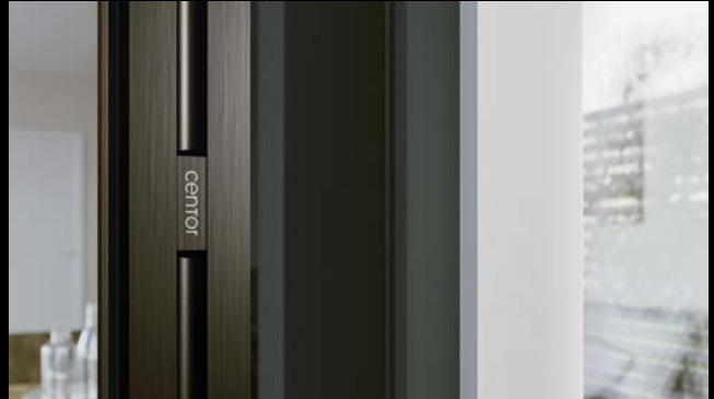
Narrow screen jamb

To see the full range of specifications for the S2 Screen, visit centor.com .