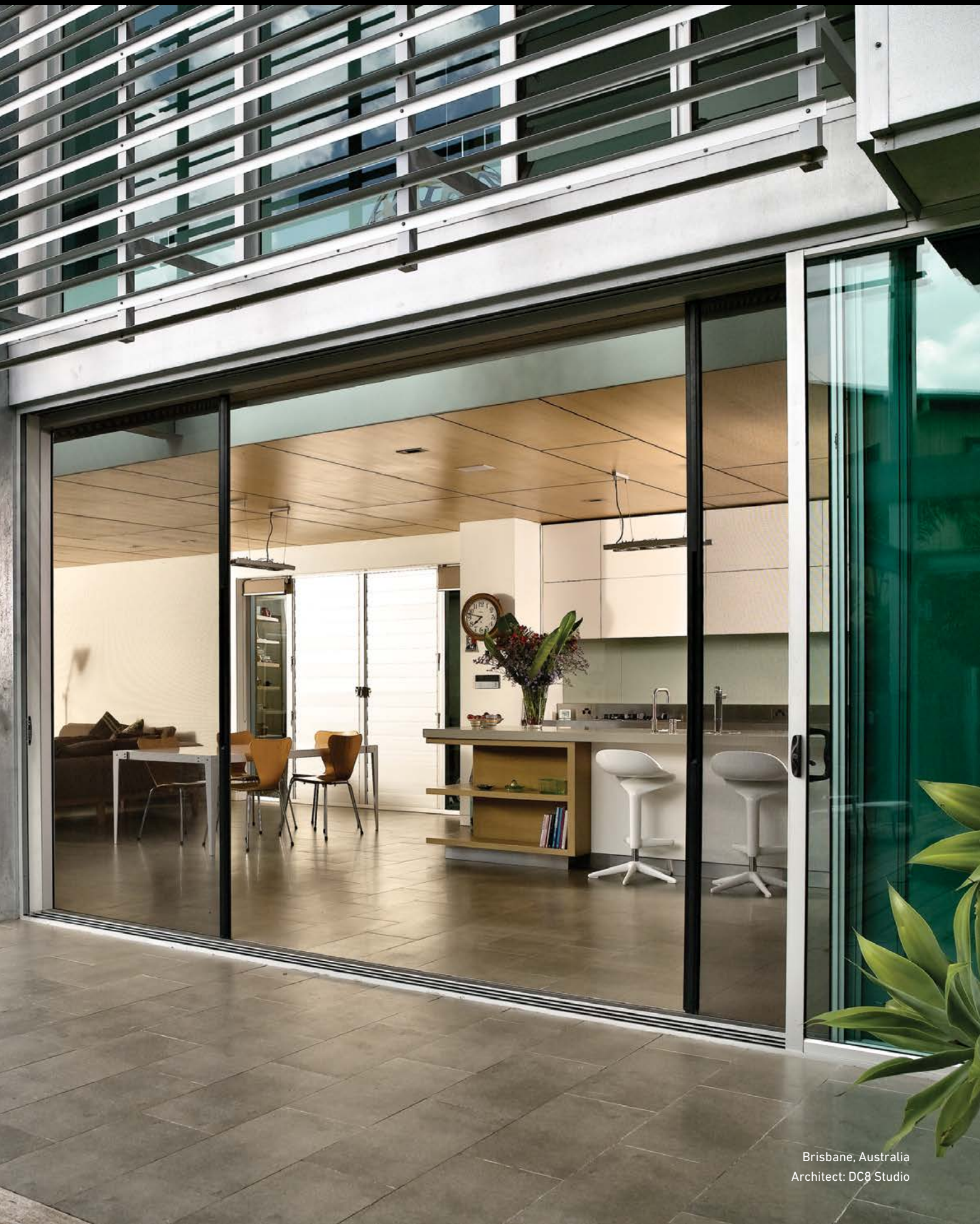
Brisbane, Australia Architect: DC8 Studio