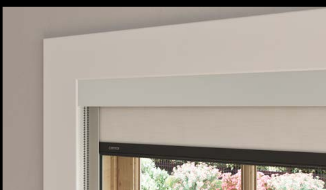
Slim aluminium frame allows for face mounting to window

Constructed from durable aluminium, S6 can be powder-coated in any colour of your choice to suit your home. To see the full range of specifications for the S6 Screen, visit centor.com .