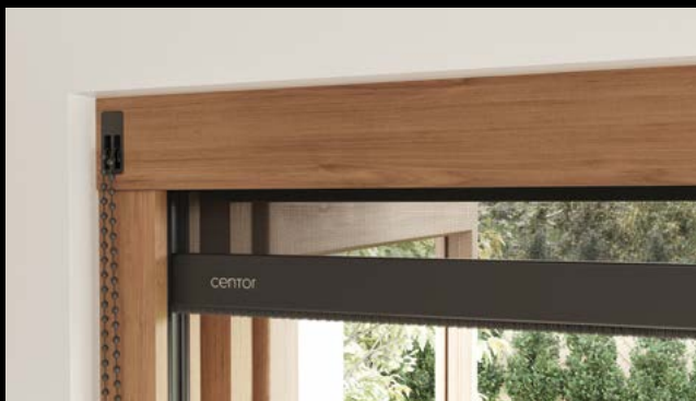
Solid timber frame

S5 is complete with durable timber cladding which adds warmth and luxury to your home. To see the full range of specifications for the S5 Screen, visit centor.com .