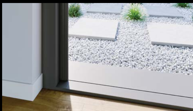
Removable sill covers