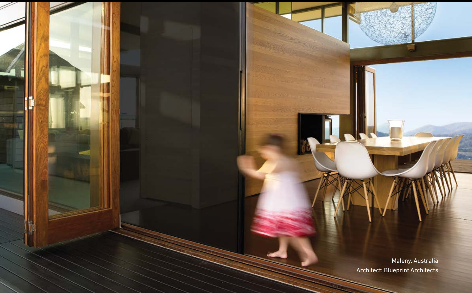
Maleny, Australia Architect: Blueprint Architects