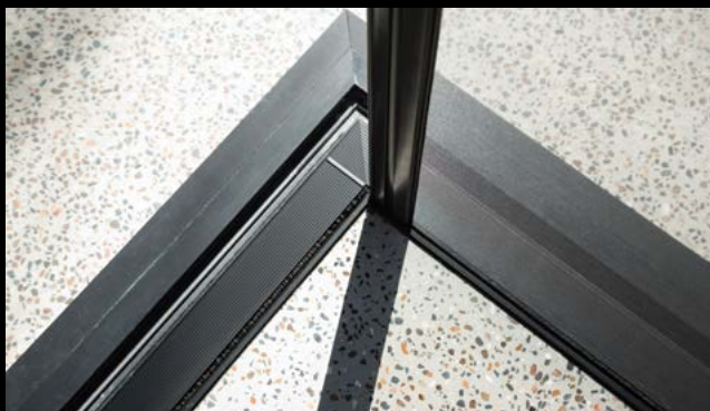
Stile meeting point